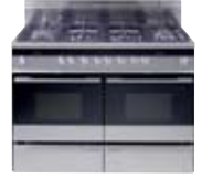
OR24SDMBGX1 24" Gas Range